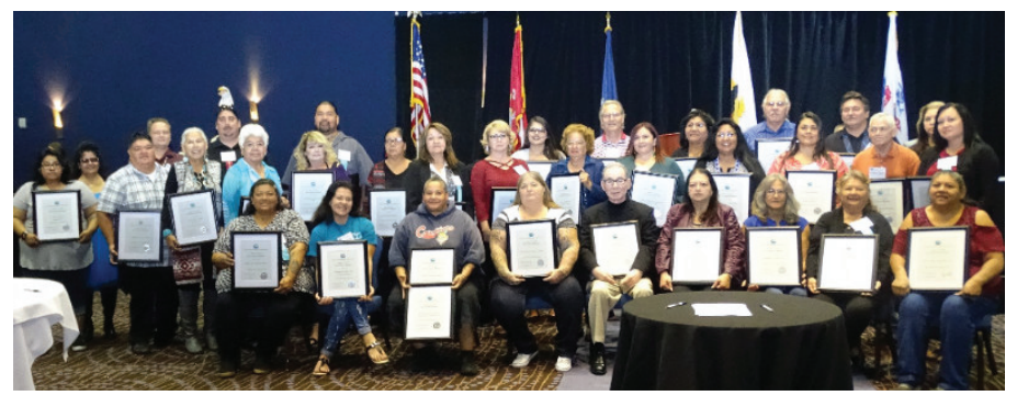
Outstanding CIMC Members. <u>Click here for a full list.</u>