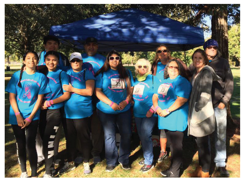
CIMC participated in the Wilton Rancheria Department of Health Third Annual Native Breast Cancer Awareness Run/Walk on October 14, 2017 in Elk Grove, California.